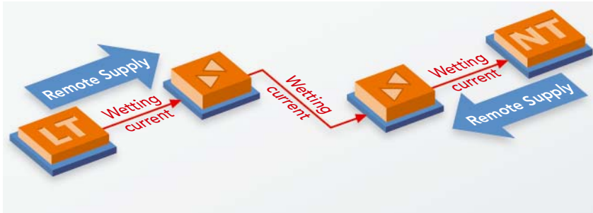
Remote supply and wetting current in a SHDSL transmission system