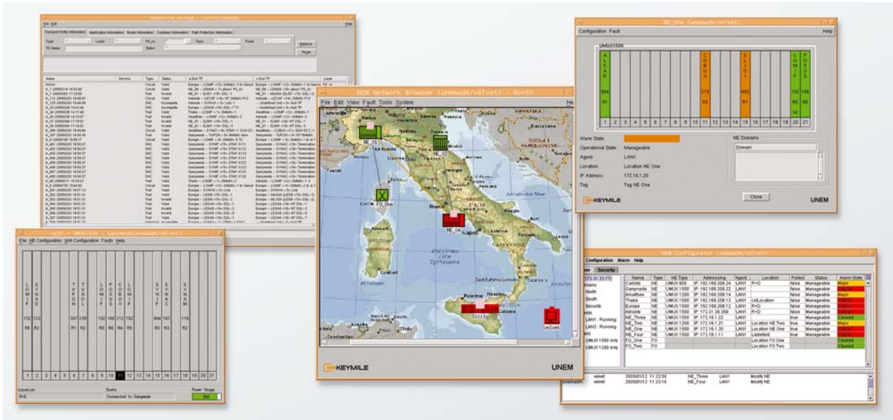
Simple configuration, fault management and visualisation of your network topology